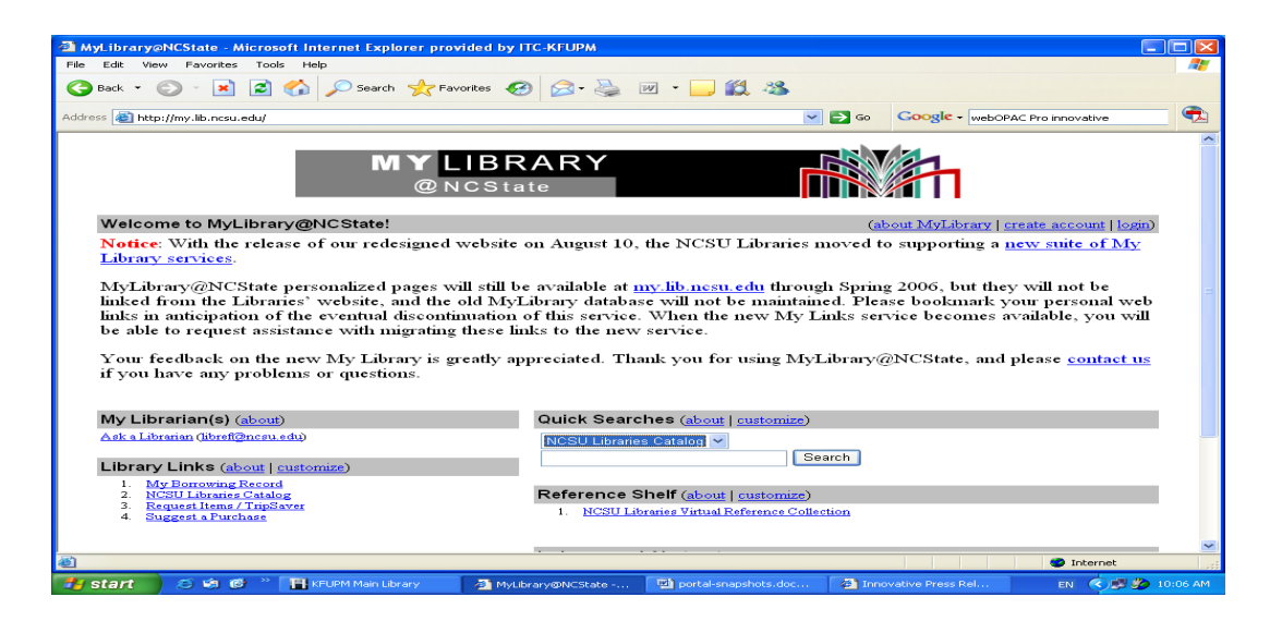
Figure 4. MyLibrary Screen