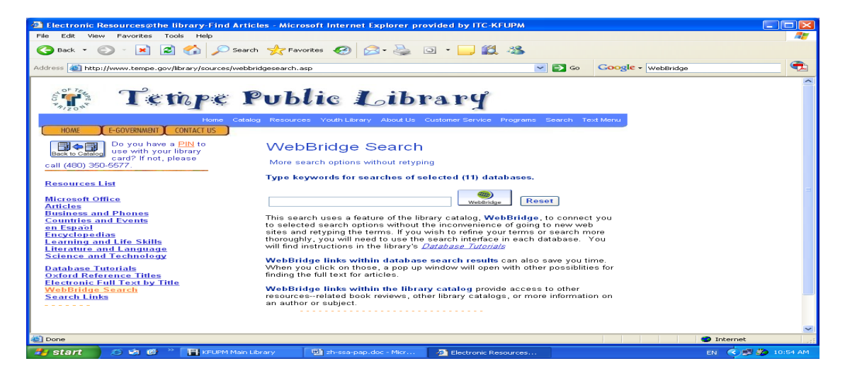
Figure 3. WebBridge Search Screen from the Tempe Public Library

(http://www.tempe.gov/library/sources/webbridgesearch.asp)